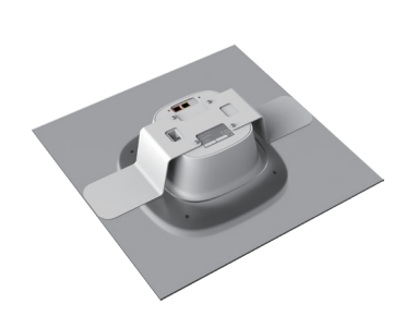
Ceiling mount (optional)